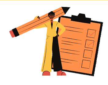
ENTREPRENEUR person who starts their own business