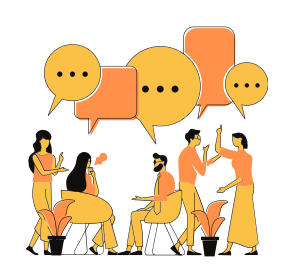
SMALL BUSINESS a company that has under 50 employees