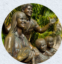
The Irwin Family