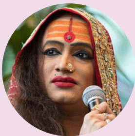
Laxmi Narayan Tripathi